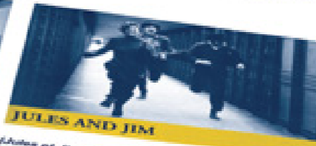
JULES AND JIM

Screens: 8:30pm + 8:30pm - 24th, 25th 26th Jan.