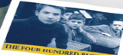
THE FOUR HUNDRED BLOWS

Les quatre cents coups 1959 Francois Truffaut