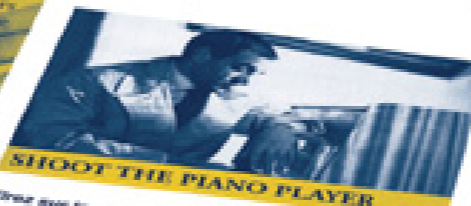
SHOOT THE PIANO PLAYER

Screens: 8:30pm + 8:30pm - 10th, 10th 17th Jan.